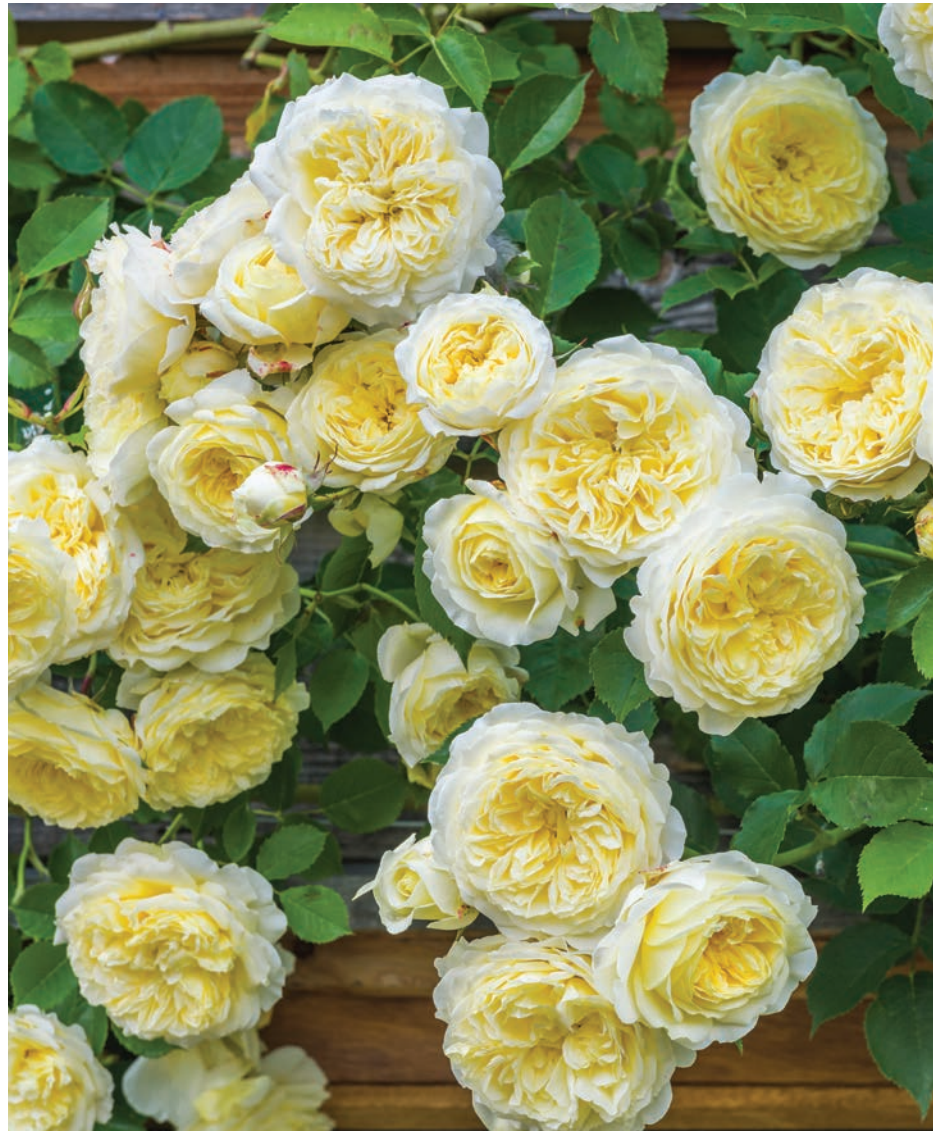
THE PILGRIM® (Auswalker) Up to 12ft.