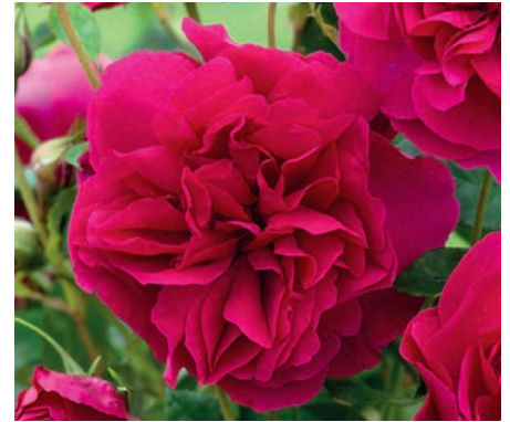
THOMAS Á BECKET™ (Auswinston) Bears heads of striking crimson-red, informal rosette flowers. Old Rose fragrance with distinct hint of lemon zest. Natural, shrubby growth. Fragrance Rating: 3. Zones: 5-11