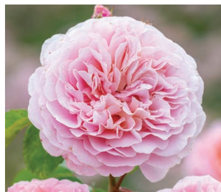
EUSTACIA VYE (Ausgedon) Soft, glowing apricot-pink roses packed with delicately-ruffled petals. Strong fruity fragrance. A very healthy variety. Bushy, upright shrub. Fragrance rating 5. Zones 4-11