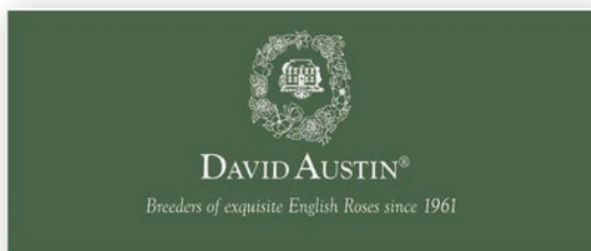
Header board (H 19" x W 46¼")