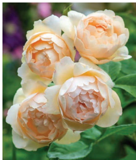
WOLLERTON OLD HALL® (Ausblanket) PP24566 Up to 12ft.