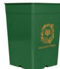
Square pot, 3 gallon