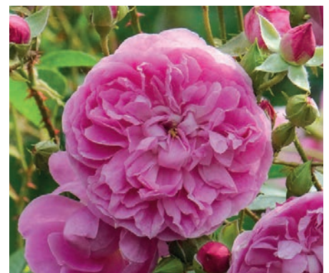
HARLOW CARR® (Aushouse) Medium-sized, mid pink rosettes of perfect formation. Strong Old Rose fragrance. Exceptional repeat-flowering. Bushy, upright growth. Fragrance rating 5. Zones 4-11