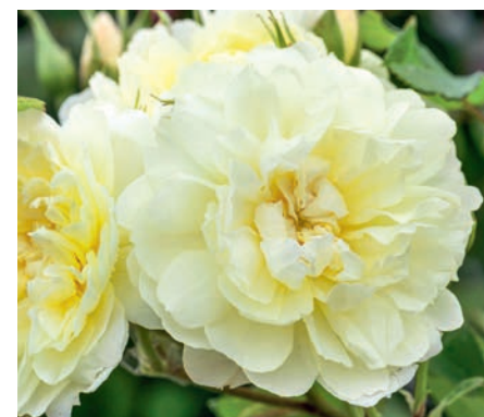
IMOGEN ™ (Austritch) Pretty, lightly scented, pale yellow blooms. Delicately frilled petals are arranged around a button eye. Forms a sturdy, upright shrub with glossy foliage. Fragrance rating 2. Zones 5-11