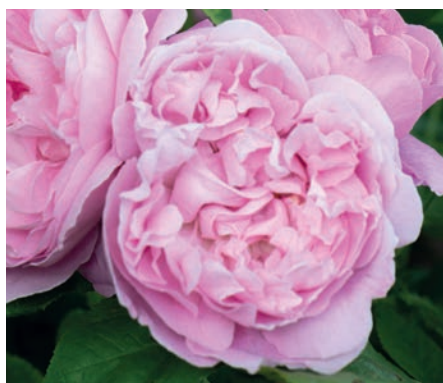
MARY ROSE® (Ausmary) Pure mid-pink blooms of an attractive, loose-petaled formation. Delicious Old Rose, almond and honey fragrance. A well-shaped, bushy shrub. Fragrance rating 4. Zones 4-11