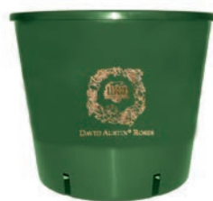
Round pot, 5 gallon