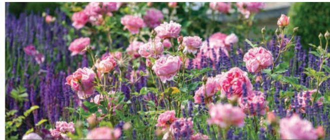
DAVID AUSTIN® Boscobel (Auscoron)

Delight your senses by adding a fragrant rose to your garden.