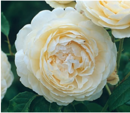
WINDERMERE ( Aushomer ) PP18713 Cupped, creamy yellow flowers with a delicious fruity citrus fragrance. Very healthy; it forms a neat, compact plant, even in warmer areas. Fragrance rating 4. Zones 5-11

FRAGRANCE RATING: 1 = LIGHT FRAGRANCE 5 = STRONG FRAGRANCE