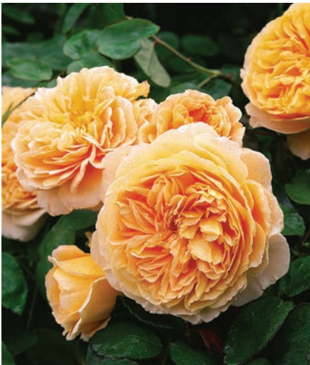
CROWN PRINCESS MARGARETA™ (Auswinter) PP13484 Up to 12ft.