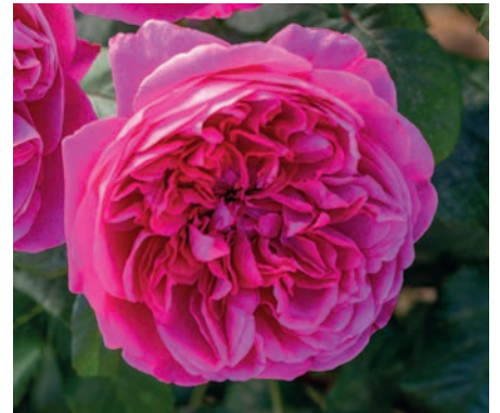
JAMES L. AUSTIN (Auspike) PP30924 Bears large, many petalled, deep pink rosettes, each with a button eye. Fruity fragrance. Forms a neat and tidy upright shrub with bushy, upright habit. Fragrance rating 2. Zones 5-11