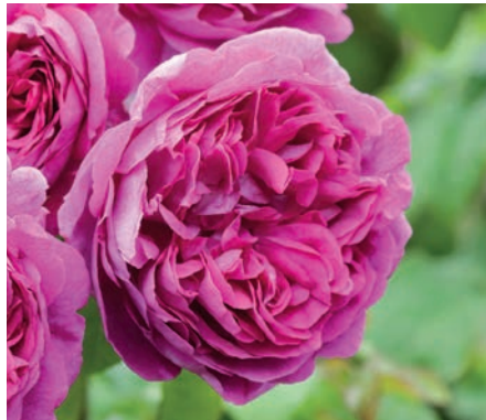
YOUNG LYCIDAS (Ausvibrant) PP20960 Quite large, deeply cupped flowers, blending deep pink, magenta and red. Delicious Tea and Old Rose fragrance, with hints of cedar wood. Fragrance Rating: 4. Zones: 5-11