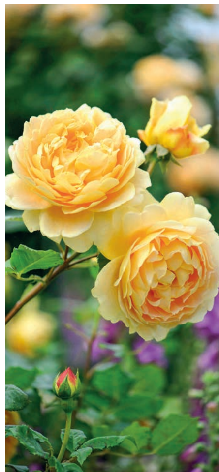
GOLDEN CELEBRATION ® (Ausgold) Giant, rich yellow cups. Strong Tea scent with notes of Sauternes wine and strawberry. Flowers freely and repeatedly. A rounded, arching shrub. Fragrance rating 5. Zones 5-11