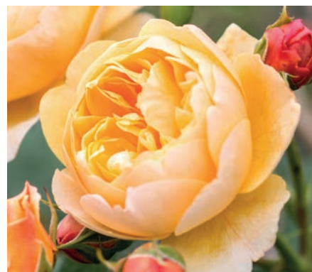
ROALD DAHL ™ (Ausowlish) PP29927 Perfect apricot blooms produced almost continually throughout the summer. Lovely fruity Tea scent. A rounded, bushy shrub. Very healthy. Fragrance rating 3. Zones 5-11