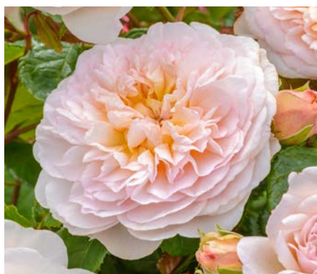
EMILY BRONTË (Auseamshaw) Beautiful rose with distinctive neat, flat blooms. Lovely soft pink apricot color that fades to cream. Strong Tea/Old Rose fragrance. Very healthy. Fragrance rating 5. Zones 5-11

FRAGRANCE RATING: 1 = LIGHT FRAGRANCE 5 = STRONG FRAGRANCE