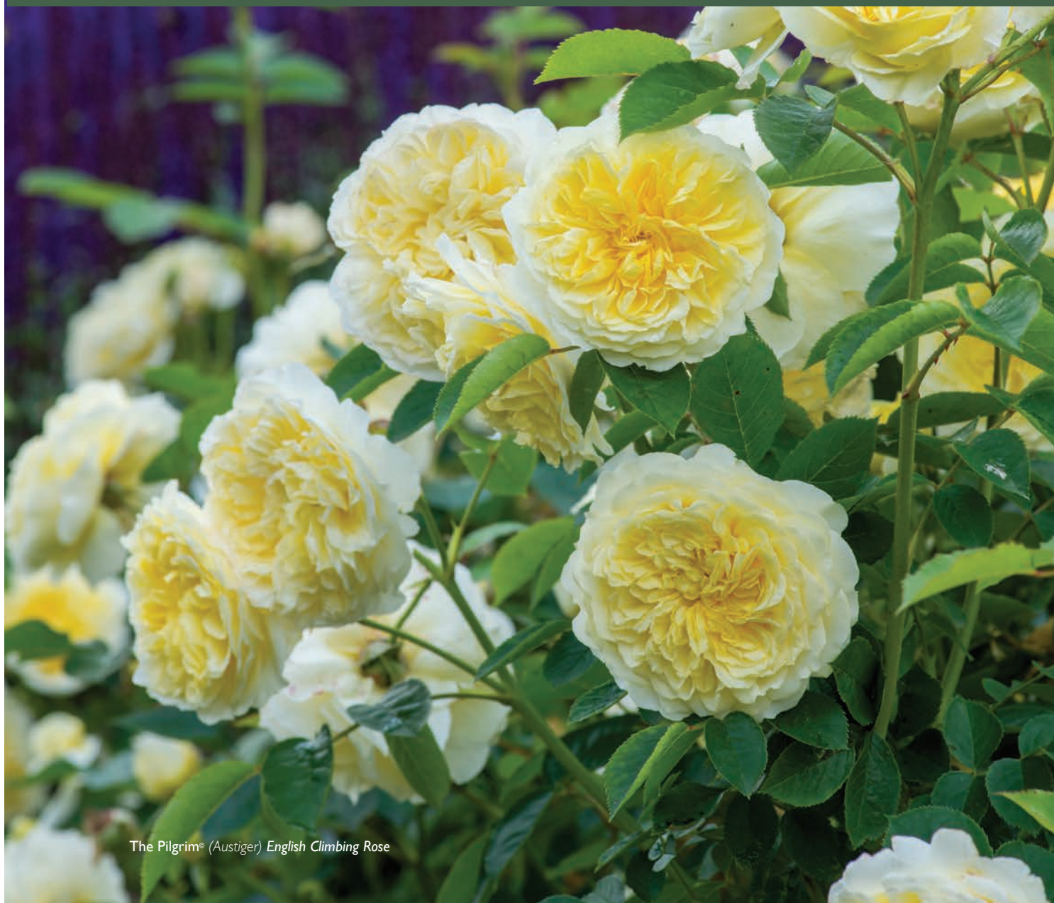
The Pilgrim® (Austiger) English Climbing Rose