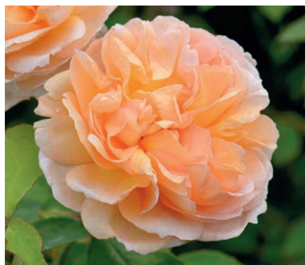
THE LADY GARDENER ™ (Ausbrass) Large, quartered rosettes packed with loosely arranged petals. They are pure apricot, paling towards the edges. Lovely Tea fragrance. Fragrance rating 3. Zones 5-11