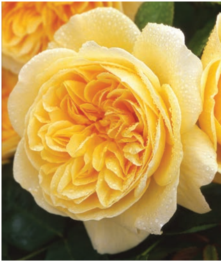
TEASING GEORGIA™ (Ausbaker) Up to 12ft.