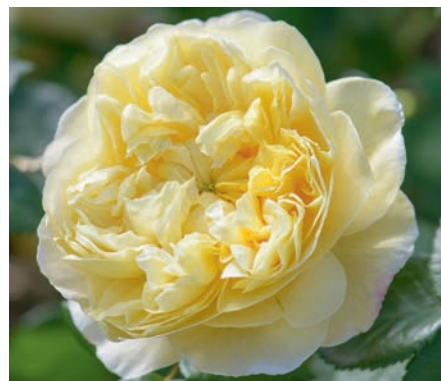
CHARLES DARWIN (Auspeet) PPI3992 Large, cupped, yellow flowers with a strong fragrance varying between soft floral Tea and pure lemon. Sturdy, with broad, spreading growth. Fragrance rating 5. Zones 5-11