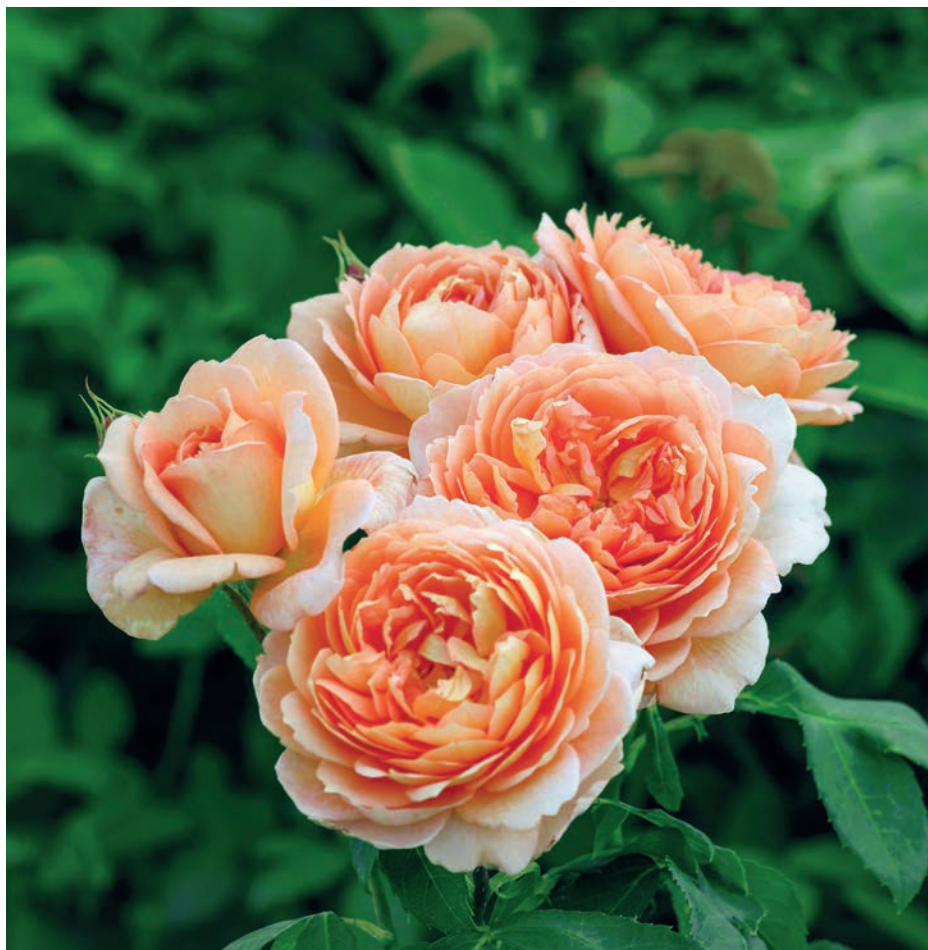
CARDING MILL ® (Auswest) The blooms are a blend of pink, apricot and yellow, giving the overall impression of orange. Lovely myrrh scent. A bushy, rounded shrub. Fragrance rating 3. Zones 5-11