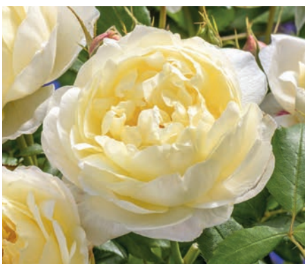
VANESSA BELL ™ (Auseasel) Pink tinged buds open into pale yellow medium-sized cups, with a rich yellow eye. Strong tea fragrance. Forms a bushy, upright shrub. Fragrance rating 5. Zones 5-11