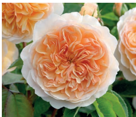
PORT SUNLIGHT ™ (Auslofty) PP19875 Medium-sized, flat, quartered rosettes of rich apricot, paling towards the edges. Light to medium Tea scent. A vigorous, rather upright shrub. Fragrance Rating: 2. Zones: 5-11