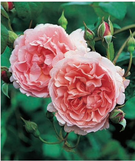
STRAWBERRY HILL (Ausrimini) PP18716 Up to 10ft.