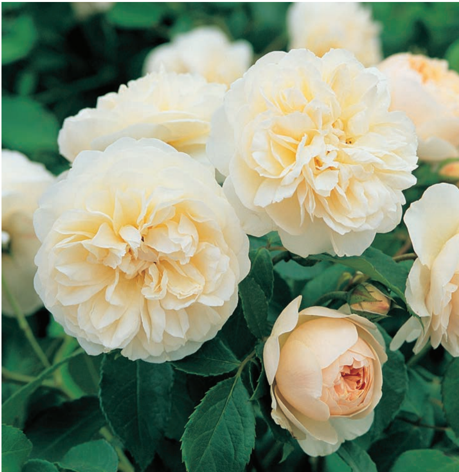
LICHFIELD ANGEL™ ( Ausrelate ) PP18702 Large, domed, cream blooms. They flower with great regularity and have a light to medium musk scent. Forms a vigorous, rounded, almost thornless shrub. Fragrance rating 2. Zones 4-11