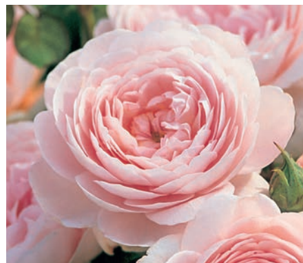
QUEEN OF SWEDEN™ (Austiger) PP17150 Exquisite, cupped, upward-facing blooms of pure soft pink. Classic myrrh fragrance. A bushy, yet upright shrub. Fragrance rating 3. Zones 4-11