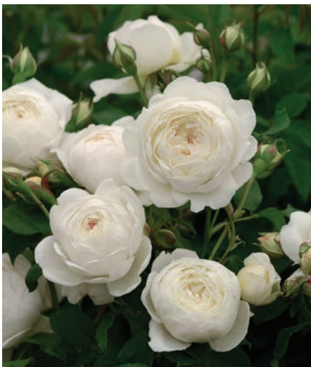
CLAIRE AUSTIN™ (Ausprior) PP19465 Up to 12ft.