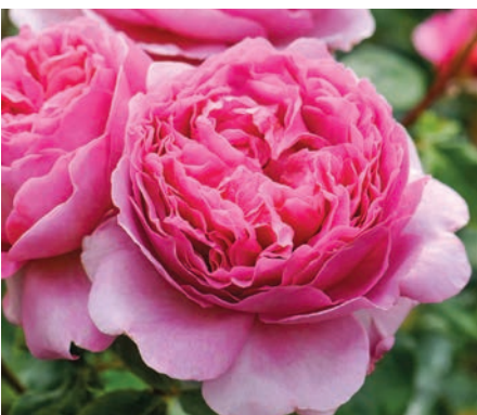
PRINCESS ALEXANDRA OF KENT (Ausmerchant) PP19828 Unusually large, deeply cupped, bright pink blooms. Strong, delicious Tea fragrance. A well-rounded shrub. Fragrance rating 5. Zones 4-11