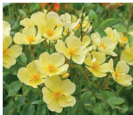
TOTTERING-BY-GENTLY (Auscartoon) USPPAF Its beauty is found in the simplicity of its single yellow flowers. They are held in large sprays on a rounded branching shrub. Light musk fragrance. Fragrance rating 2. Zones 5-11