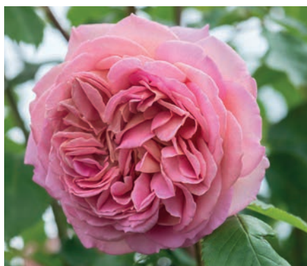
JUBILEE CELEBRATION™ (Aushunter) Large, domed, coral-pink flowers, held elegantly on graceful, arching growth. Delicious fruity scent with hints of fresh lemon and raspberry. Fragrance rating 5. Zones 5-11

FRAGRANCE RATING: 1 = LIGHT FRAGRANCE 5 = STRONG FRAGRANCE