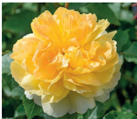
MOLINEUX ™ (Ausmol) Medium-sized, neat, rosette blooms of rich yellow. Flowers with exceptional freedom and continuity. Short, even, upright growth. Fragrance rating 2. Zones 5-11