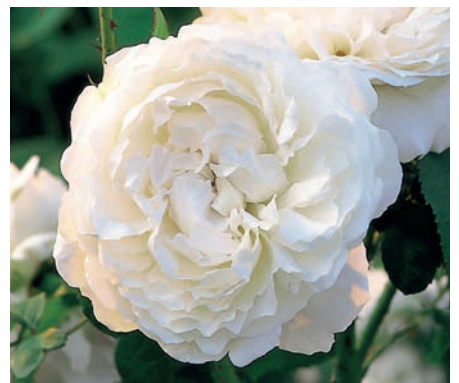
WINCHESTER CATHEDRAL™ ( Auscat ) Masses of medium-sized, loose petalled, white rosettes, with an Old Rose scent. A well-shaped shrub with twiggly, bushy growth. Fragrance rating 3. Zones 4-11