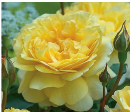
THE POET'S WIFE (Auswhirl) PP27364 Rich yellow flowers which repeat almost continually from early summer into fall. Strong, fruity rich fragrance, with a hint of lemon. A bushy, rounded shrub. Fragrance rating 5. Zones 4-11

FRAGRANCE RATING: 1 = LIGHT FRAGRANCE 5 = STRONG FRAGRANCE