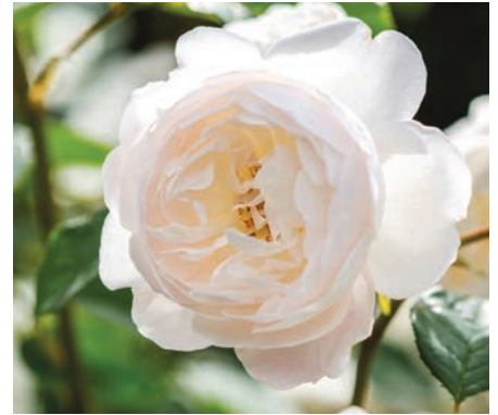
DESDEMONA™ ( Auskindling ) PP30054 White chalice-shaped blooms, tinged with pink. Strong Old Rose fragrance with hints of almond blossom and lemon zest. A neat, bushy shrub. Fragrance rating 5. Zones 5-11