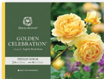
Bed label (H 7" x W 11")