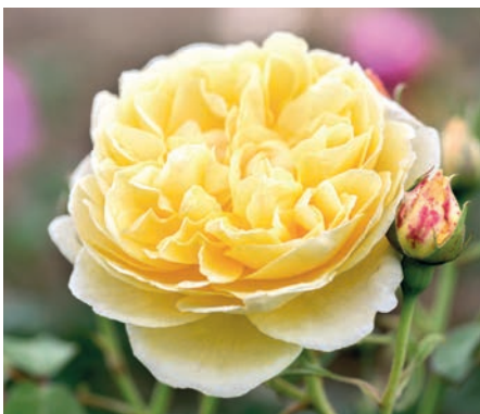
CHARLOTTE ™ (Auspoly) Exquisite, cupped, many petalled rosettes of soft yellow. Light to medium Tea scent. Compact, bushy habit with even, upright growth. Fragrance rating 2. Zones 5-11