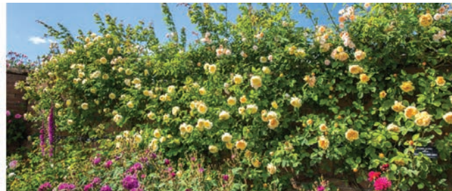
DAVID AUSTIN® The Pilgrim (Auswalker)