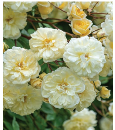
MALVERN HILLS® (Auscanary) Up to 15ft.