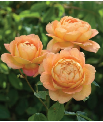
LADY OF SHALOTT™ (Ausnyson) PP22171 Up to 8ft.