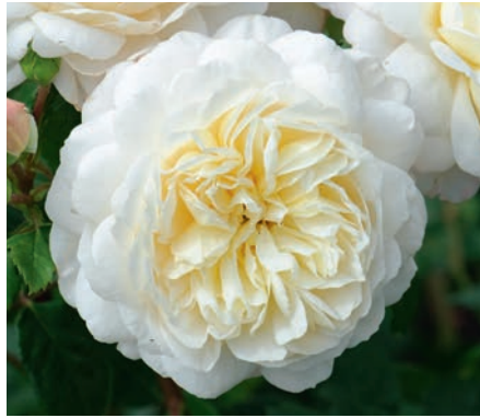
CROCUS ROSE™ ( Ausquest ) PP14092 Very free-flowering, bearing large clusters of softly fragrant, creamy apricot rosettes. A bushy, arching shrub with elegantly arching stems. Fragrance Rating: 2. Zones: 5-11