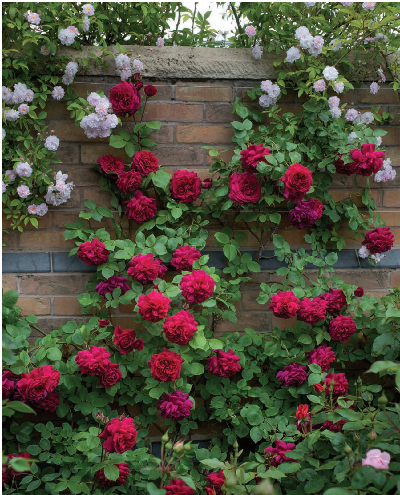
Tess of the D'Urbervilles

English Climbing Roses are amongst the very best of all climbing plants. They repeat flower abundantly, clothed in blooms from the top to the base of the plant. Growing climbers on walls, fences, arches, obelisks and pillars draws the eye up from the ground, bringing color and fragrance to head height.