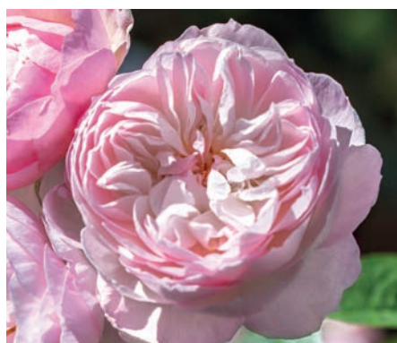
GENTLE HERMIONE™ (Ausnumba) PP17500 Beautiful, shallowly-cupped, light pink flowers, paling to soft blush on the outer petals. Strong, warm myrrh fragrance. An attractive, quite broad shrub. Fragrance rating 5. Zones 5-11