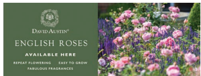
Brand banner, PVC (H 27" x W 70" with eyelets)