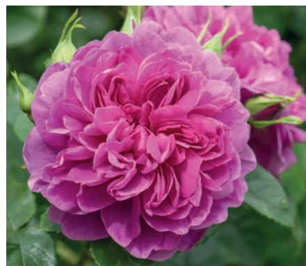
PRINCESS ANNE (Auskitchen) PP23099 Clusters of rich pink blooms. Flowers over a long period with remarkable regularity. Strong Tea Rose fragrance. A bushy, upright shrub. Very healthy. Fragrance rating 5. Zones 4-11