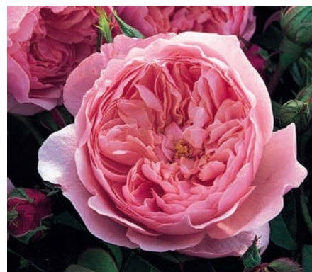
THE ALWICKS® ROSE (Ausgrab) Broad, full-petaled, shallow cups of soft pink. Old Rose fragrance with raspberry notes. Bushy, relatively upright growth. Fragrance rating 3. Zones 4-11