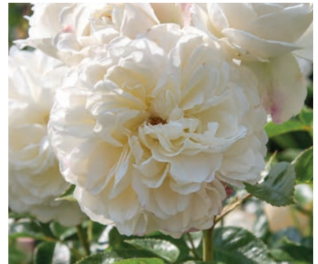
TRANQUILLITY™ ( Ausnoble ) PP25063 Perfectly formed, white rosettes. Light apple fragrance. A vigorous shrub; its growth is bushy and upright, clothed in light green foliage. Fragrance rating 1. Zones 5-11