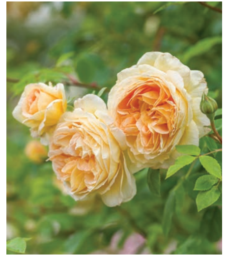
BATHSHEBA™ (Auschimbley) Up to 10ft.