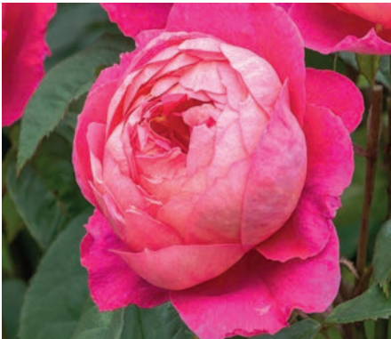
BENJAMIN BRITTEN® (Ausencart) The blooms are a unique glowing shade of deep red-pink. The fruity fragrance has aspects of wine and pear drops. A dense, rather upright shrub. Fragrance rating 3. Zones 4-11