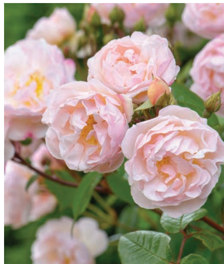
THE LADY OF THE LAKE™ (Ausherbart) Up to 12ft.