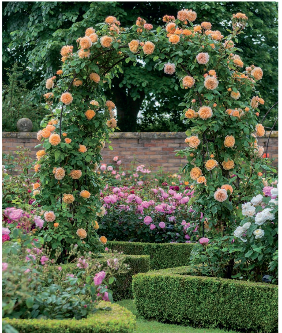
Crown Princess Margareta™