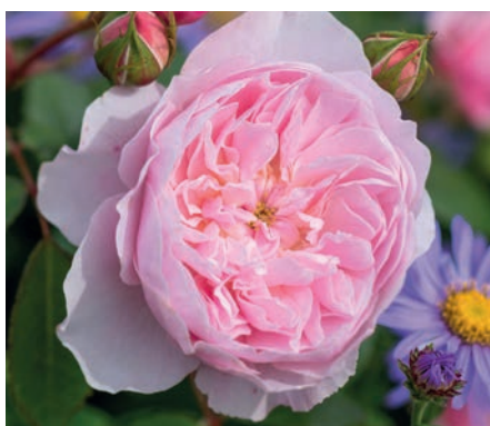
WISLEY™ 2008 (Ausbreeze) PP20962 Perfect, shallowly-cupped, rosette flowers of pure light pink. Light fruity fragrance. A vigorous shrub with elegantly arching growth. Fragrance Rating: 1. Zones: 5-11