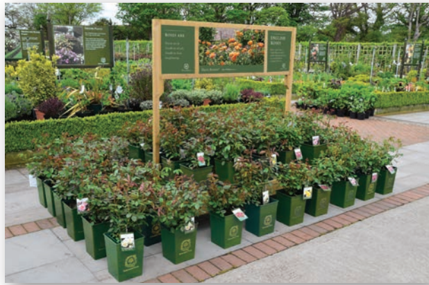
Display unit & POP signage (72½" wide x 67" high x 45" deep)