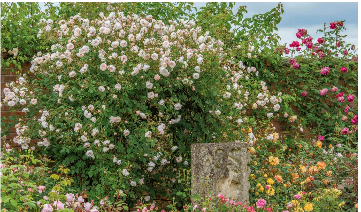
The Albrighton Rambler™