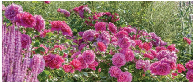
DAVID AUSTIN® Princess Anne (Auswilder)

It takes our rose experts 10 years to patiently breed each new English Rose by hand.