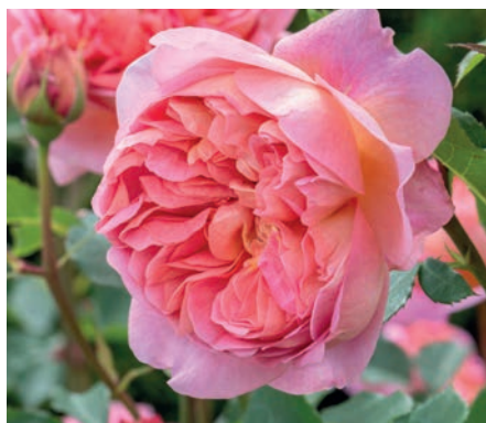
BOSCOBEL™ (Ausconsin) PP25064 Beautifully formed, upward-facing, coral-pink blooms with a strong myrrh fragrance. A vigorous variety; it quickly forms an upright shrub. Fragrance rating 5. Zones 5-11