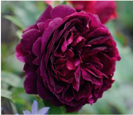
MUNSTEAD WOOD™ (Ausbernard) PP19876 Deep velvety crimson blooms. Strong Old Rose fragrance with fruity notes. Forms a broad shrub, with bushy, spreading growth. Fragrance rating 5. Zones 5-11

FRAGRANCE RATING: 1 = LIGHT FRAGRANCE 5 = STRONG FRAGRANCE