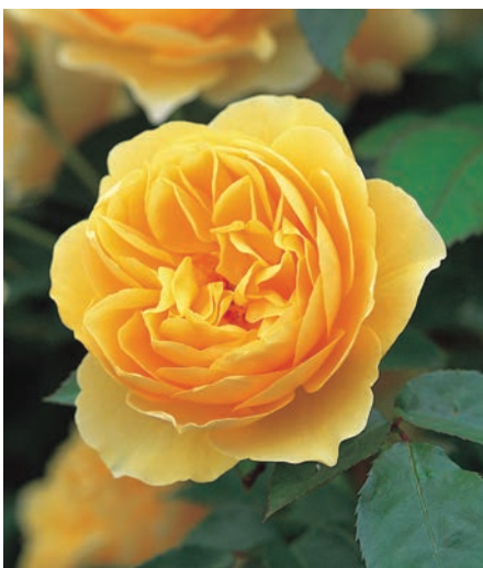
GRAHAM THOMAS® (Ausmas) Up to 12ft.