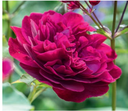
DARCEY BUSSELL™ (Ausdecorum) PP18717 Deep, rich crimson-pink, medium-sized rosettes. Light-medium fruity fragrance. A compact shrub with attractive bushy growth. Fragrance rating 2. Zones 5-11