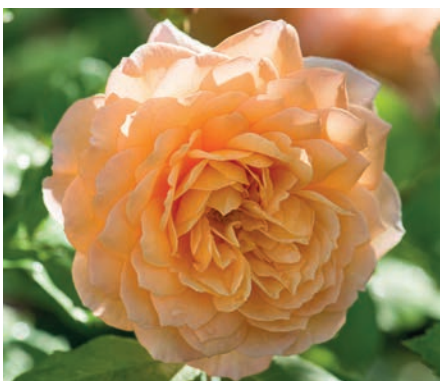
GRACE ® (Auskeppy) Neat, pure apricot rosettes, produced almost continually into the fall. Warm Tea scent. A branching shrub with broad, arching growth. Fragrance Rating: 2. Zones: 5-11