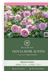
Hanging tag (H 7" x W 5½") Supplied free with every rose