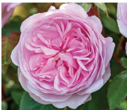
OLIVIA ROSE AUSTIN (Ausmixture) Beautiful, cupped rosettes in lovely mid-pink color. Delicate fruity fragrance. Exceptionally long bloom season. Very healthy, well-balanced shrub. Fragrance rating 2. Zones 4-11