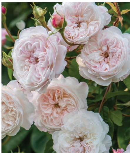
THE ALBRIGHTON RAMBLER™ (Ausmobile) Up to 10ft.