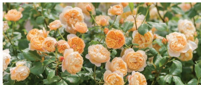
DAVID AUSTIN® Roald Dahl (Auswilder)