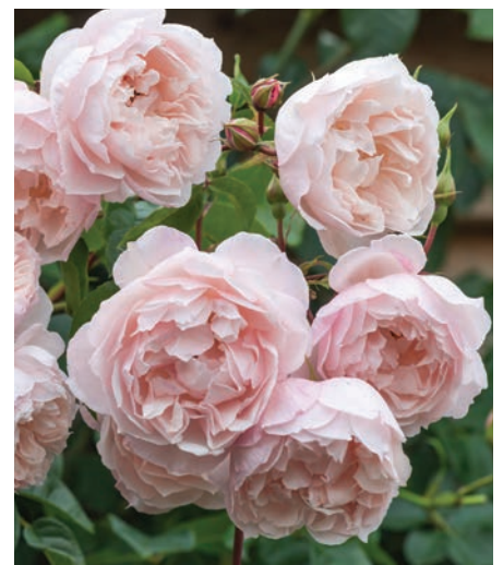
THE GENEROUS GARDENER® (Ausdrawn) Up to 15ft.