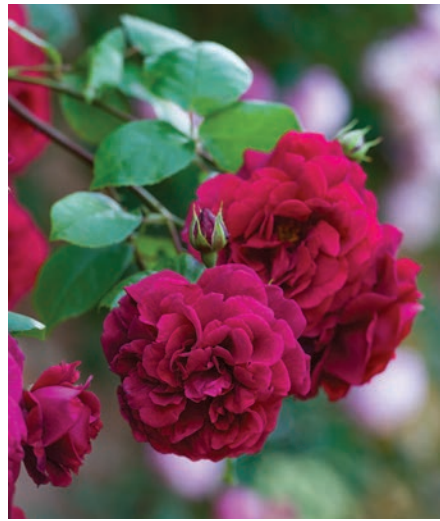
TESS OF THE D'URBERVILLES™ (Ausmove) Up to 8ft.